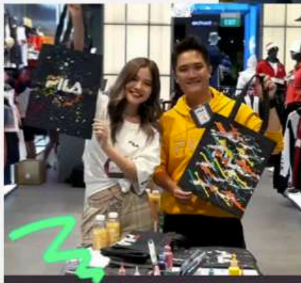
Denim Art Jamming Workshop for KOL / media guests. Launch of new denim sportswear collection