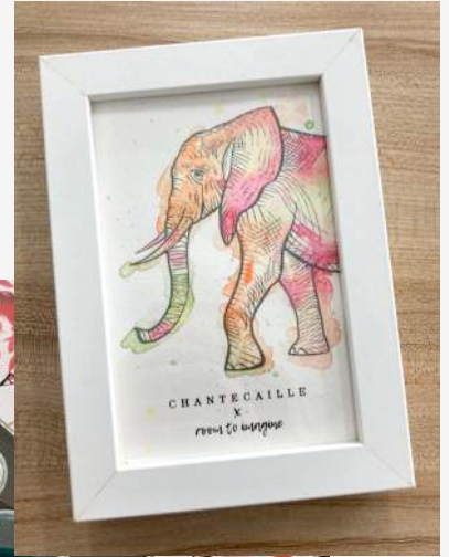
Fluid Ink Painting Workshop for media guests. Eyeshadow palette launch supporting the conservation efforts of Asian Elephants.