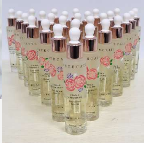
Handpainted flowers on Chantecaille bottles for VIP guests. Additional name personalisation for the media.