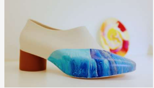
In-boutique brand activation with acrylic pour workshop. VIP event for the launch of a new style of shoes “Melissa Mid”